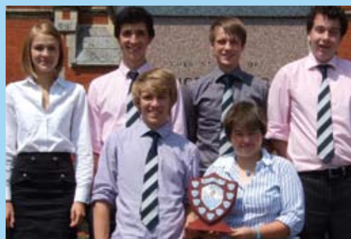
Surf's Up (front), Moto-X-Treme (back)