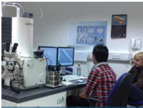
A scanning electron microscope being used to view a human hair