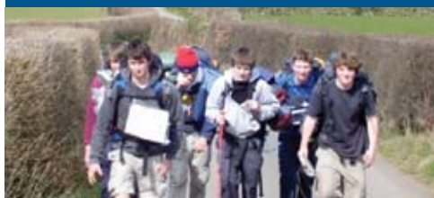
Duke of Edinburgh Expeditioners on the home straight near Coniston Water, in the Lake District, at Easter

Over 50 students braved the elements on Silver and Gold Practice and Assessed expeditions in the local area and almost 80 have just been to Derbyshire and Yorkshire during the October half term. Year 11 will have an opportunity to organise an expedition to Derbyshire or Yorkshire after their GCSE examinations in June and Year 9 will also be attempting their Bronze Practice Expedition during the same month.